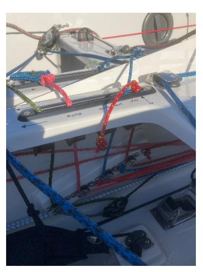
Spinnaker halyard pump cleat show extra cleat to prevent unwanted launching.

Port & Starboard case top views showing control line exits and cleats