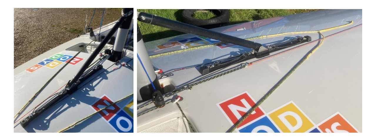
Strut/ Ram system with track on the deck. The jib cunningham line and cleat is also in veiw.